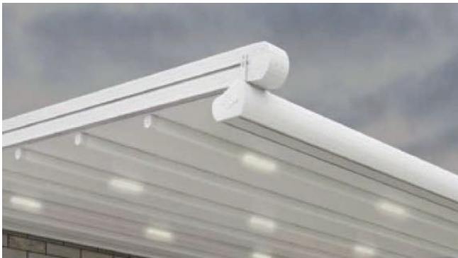
In-built guttering system