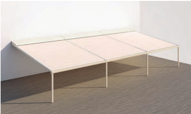
Coupled system: maximum of 3 bays at 4.5m in wide