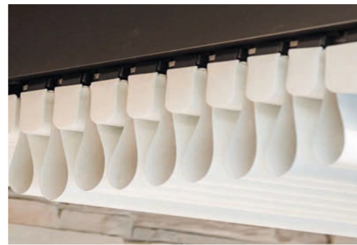
Fabric runs underneath of the side tracks