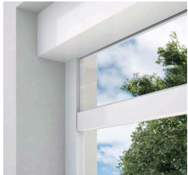
Clear PVC fabric 0-15% Block out