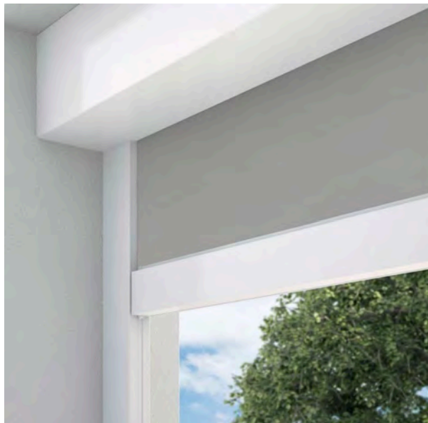
Acrylic or PVC fabric 95-100% Block out

Fabric transparency varies from 0% to 100% block out