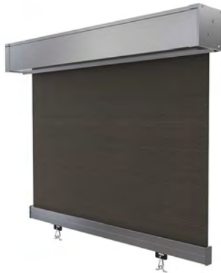
Screentex 101/102 Basic