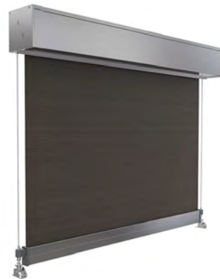
Screentex 101/102 Wire Guides