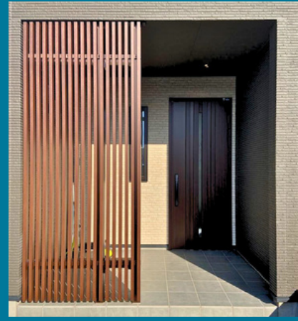
RAIL SYSTEM STYLE Shroud Fix for a classic fence look