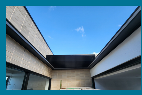
INCLINING ALUMINIUM LOUVRE BLADES Up to 80° opening angle

CONSTRUCTION Powder Coated Extruded Aluminium